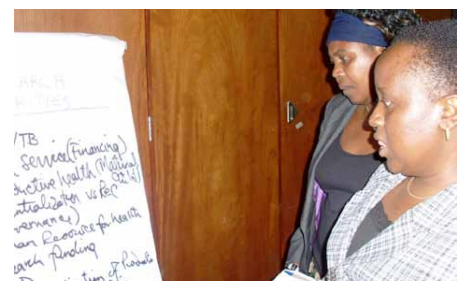
Participants exchange views on issues concerning resource mobilisation and funding for research and innovation for health

an important role in supporting efforts to strengthen national research systems for health. However, it was also noted that research for health and support from international agencies still portrays elements of being top-down and inequitable, and international and multilateral agencies need to address the recurring issues concerning support for research for health that is in line with the country priorities. It is in this regard that